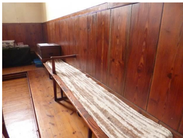
Fig.4: fitted wall benches and pine dado panelling in large meeting room

The small meeting room to the east is a narrow rectangular space with a projecting chimney breast on the north wall, with cast-iron fireplace in plain stone surround. The alcove to the right has fitted cupboards with plain panelled doors, in painted pine. Walls and ceiling are plain plastered, with a reeded cornice, and the floor is carpeted. A door inserted in the east wall leads to the 1992 extension with two WCs and small kitchen, also served by a hatch.