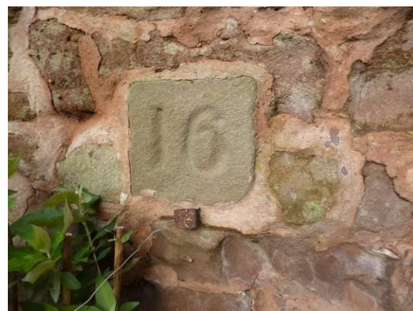
Fig.8: inscribed stone and metal marker with row number