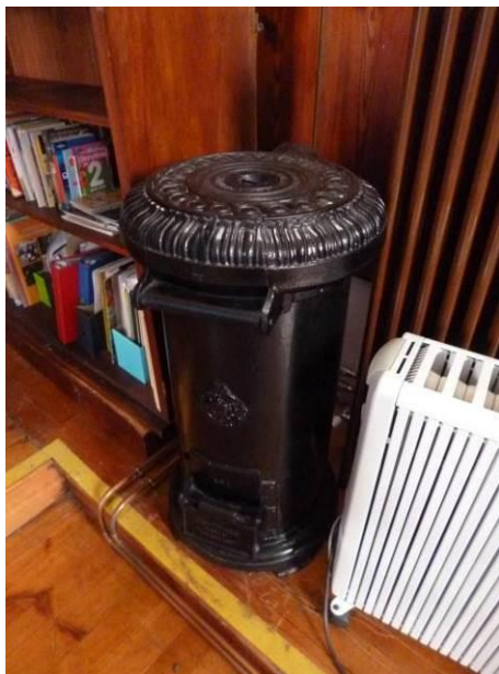
Fig.3: cast-iron stove, ex situ

The interior is entered by the lobby on the east side of the large meeting room; from this double pine doors with fielded panels lead into the large meeting room, the staircase leads of the south and to the north a small lobby leads to the small meeting room. The panelled door from the lobby has been re-set in a stud wall inserted in 2006, to form a disabled WC on the north side of the lobby. The dogleg staircase has pine stick balusters, square newels and elm treads. The large meeting room is a lofty well-lit space with a gallery along the east side, and the ministers' stand to the west. The gallery is supported on four cylindrical timber columns with simple moulded caps and bases; one has been temporarily removed due to structural concerns and a steel prop inserted. The front of the gallery and the stand has pine fielded panels, and walls are lined to dado level with plain vertical pine boards; the top rail swept up behind the stand. The raised platform to the stand continues along the other walls, with fitted pine benches. The walls and ceiling are plain-plastered with a moulded cornice, and the floor is laid with plain pine boards (probably renewed). In the centre is a stone base for a heating stove. The latter is now ex situ but retained in the room.