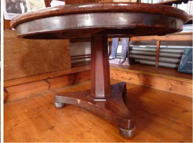
Fig.6: circular table