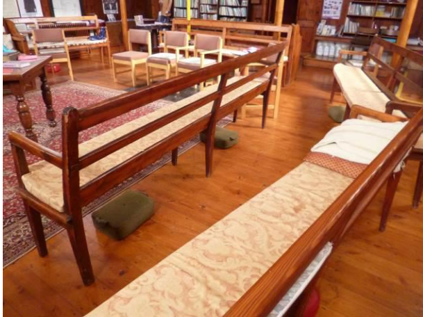
Fig.5: pine benches in the meeting house

Seating in the large meeting room is arranged in a square with a mixture of modern chairs and old benches. There are eight pine benches which appear to be 19 th century in date; all have open railed backs, open arms and tapered legs and two have solid bench ends. Lining the walls below the gallery, there are various bookshelves given by Friends, and in the centre of the room either a square oak table of mid twentieth century date or an early nineteenth century circular hardwood pedestal table is used.