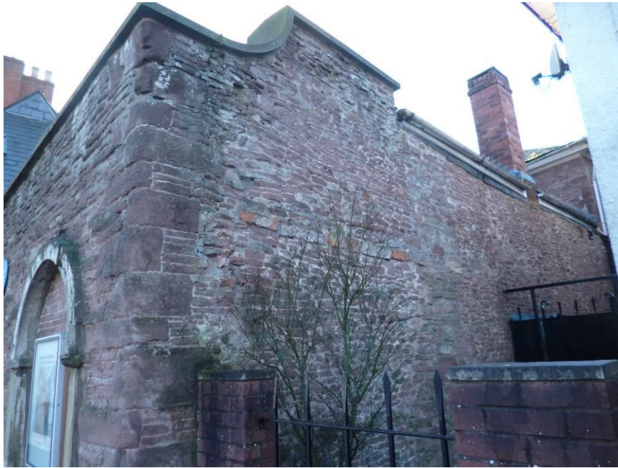
Fig.1: the front screen wall and the north wall of the small meeting room may be part of the earlier meeting house, built in the 1670s

with stone sills and flat heads. The north elevation is blind, with evidence for rebuilding that may relate to the earlier meeting house.