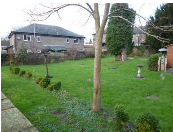
Fig.7: view of burial ground from the south-east

The burial ground dates from the early 1700s and is on the west side of the meeting house, hidden from the street. The L-plan plot is enclosed by stone walls with flat copings, and is mainly laid to grass with a few shrubs and trees, with a small pond for wildlife. A public footpath runs along the south edge of the plot, connecting Brampton Street with the street to the west. The ground is no longer used for burials; the last burial was in the 1920s but ashes are scattered. The burial plots are laid out on a grid, with the rows marked by letters and numbers on small metal plates and inscribed stones set in the boundary walls and the west wall of the meeting house (Fig.7). Burials are recorded on a framed copy of the burial ground plan dated 1823, hung inside the meeting house (Fig.6). The marker stones are all laid flat; the oldest dates from 1765. Prominent local Quakers buried here include Thomas Prichard (died 1843) and Henry Southall who established a weather station in Ross (died 1916).